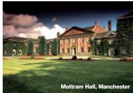
Mottram Hall, Manchester