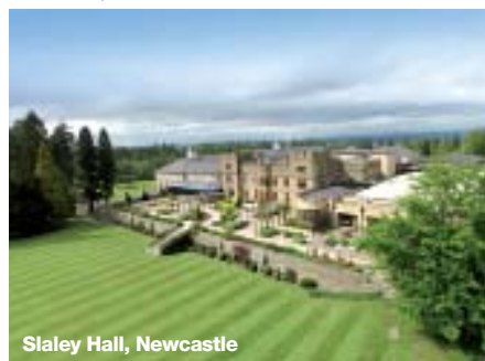
Slaley Hall, Newcastle

At 331 sqm, the Ramsay Room is the largest facility and can seat 90 people banquet-style, 120 theatre-style or 150 for a reception. Corporate packages are available for a daily rate of £55 per person – this includes an OHP, screen, flip chart, stationery and wifi internet access, as well as lunch, snacks and drinks.