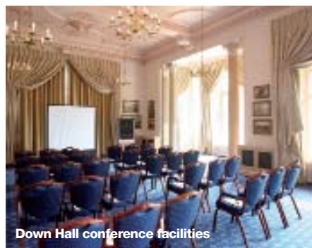
Down Hall conference facilities

A 15-minute drive from Manchester airport takes you to Mottram Hall, a Georgian pile dating from 1721. The hotel is set in 270 acres of woodland and has landscaped gardens, a lake, and a par-72 golf course. In addition, the grounds are