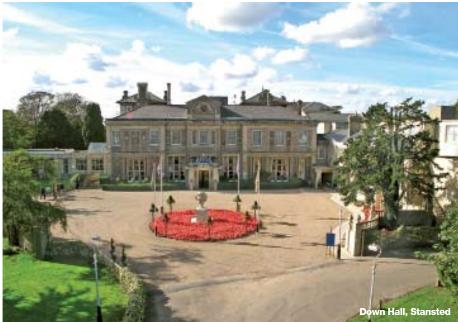
Down Hall, Stansted