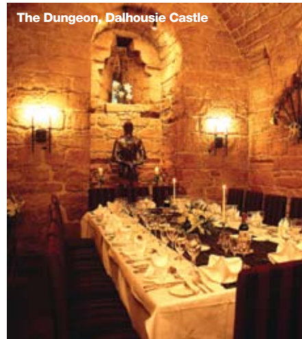
The Dungeon, Dalhousie Castle

For an additional £140, the 24-hour package includes all of the above, as well as a three-course dinner, overnight accommodation, breakfast and unlimited use of the spa.